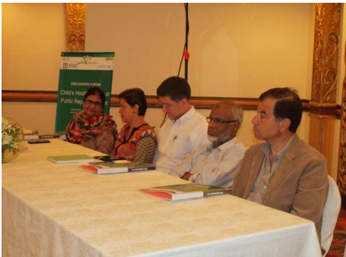
International Delegates on The Head Table