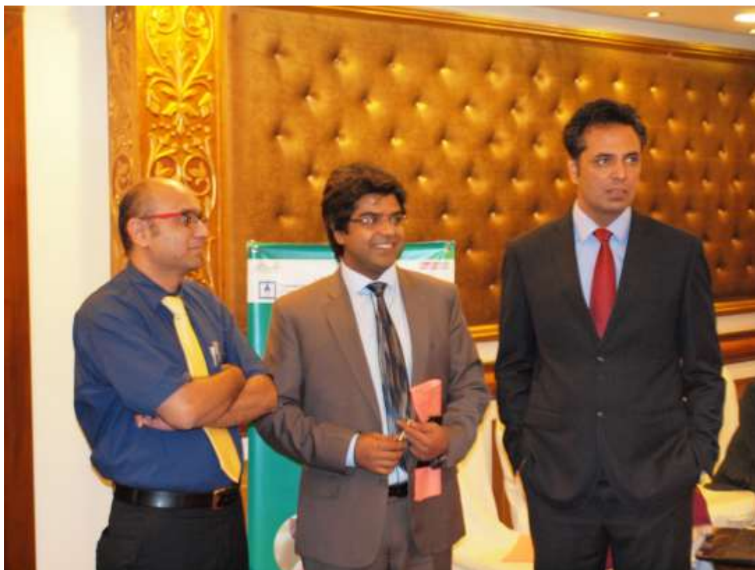
Director Surveillance EPI with Forum's Facilitator and Organizer