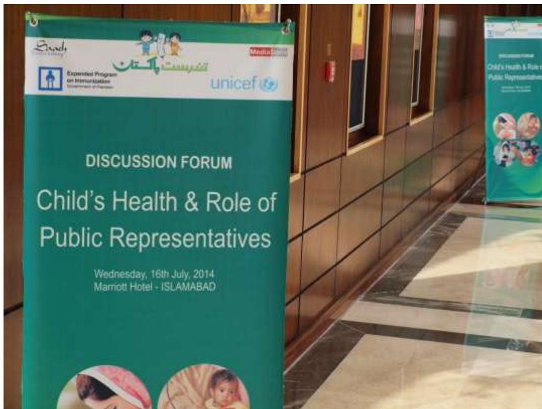
IEC Material Displayed at the Entrance of the Discussion Forum Venue