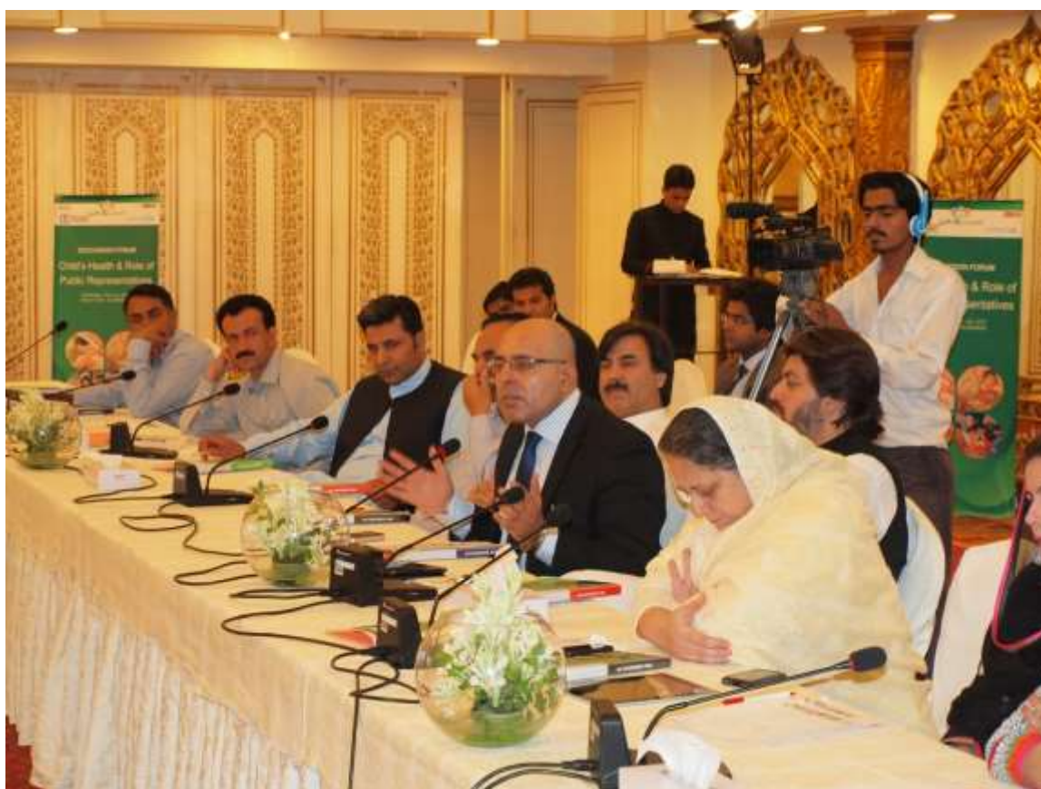
A Public Representative Sharing his thought during the Open Forum Discussion