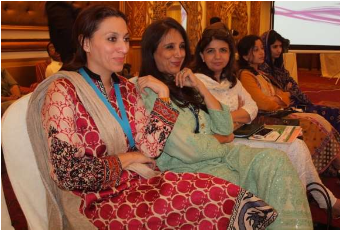
The Brains Behind The Initiative