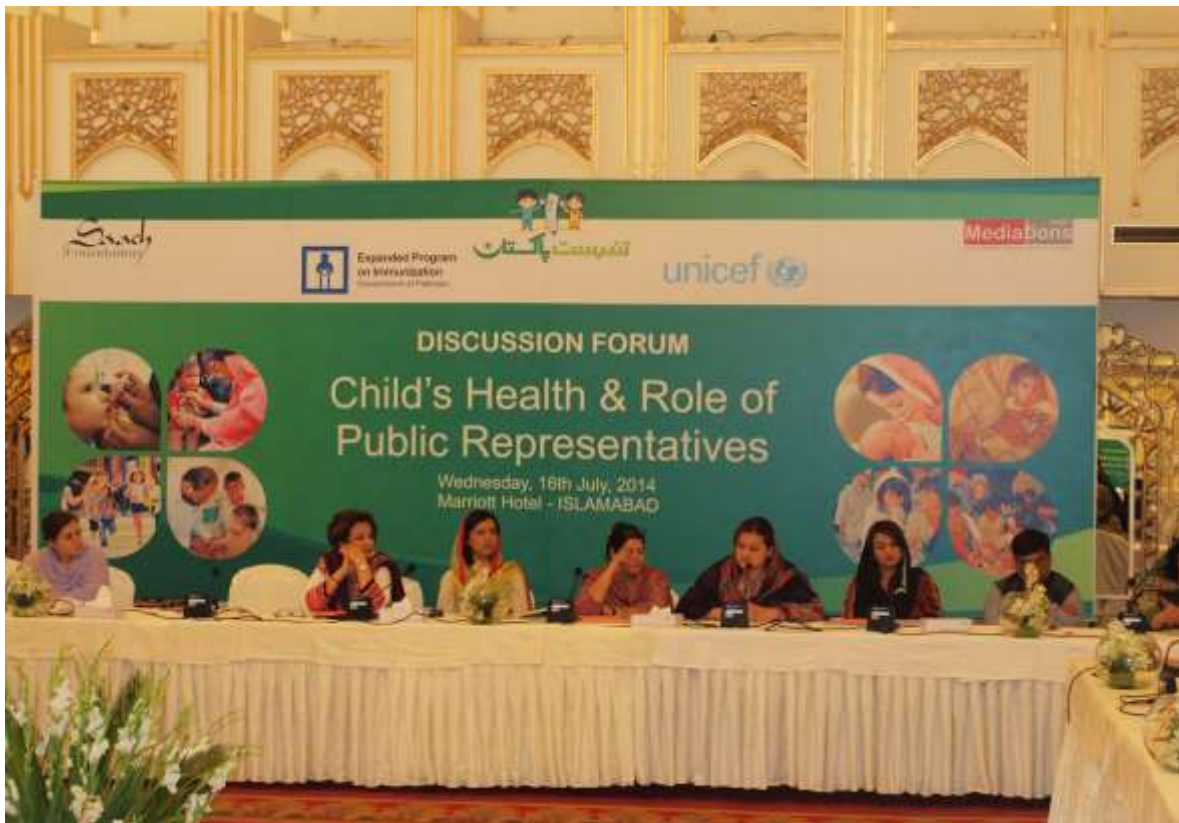
A Public Representative Sharing his thought during the Open Forum Discussion