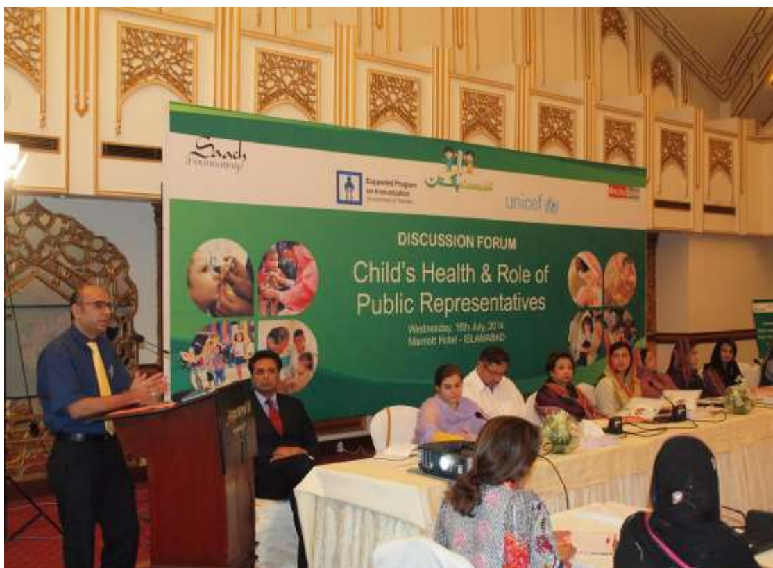
Director Surveillance Delivering his Presentation