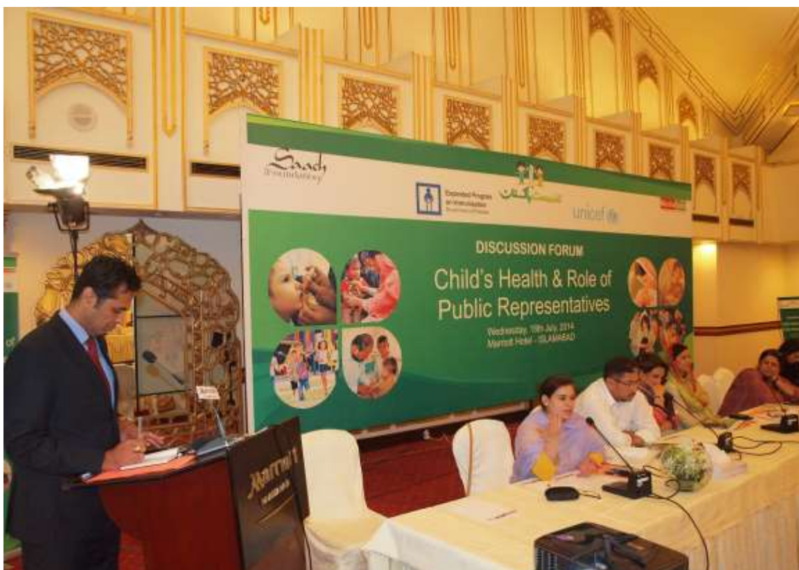
A Public Representative Sharing his thought during the Open Forum Discussion