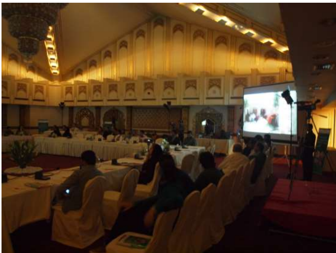
Screening of Documentary Film in Progress