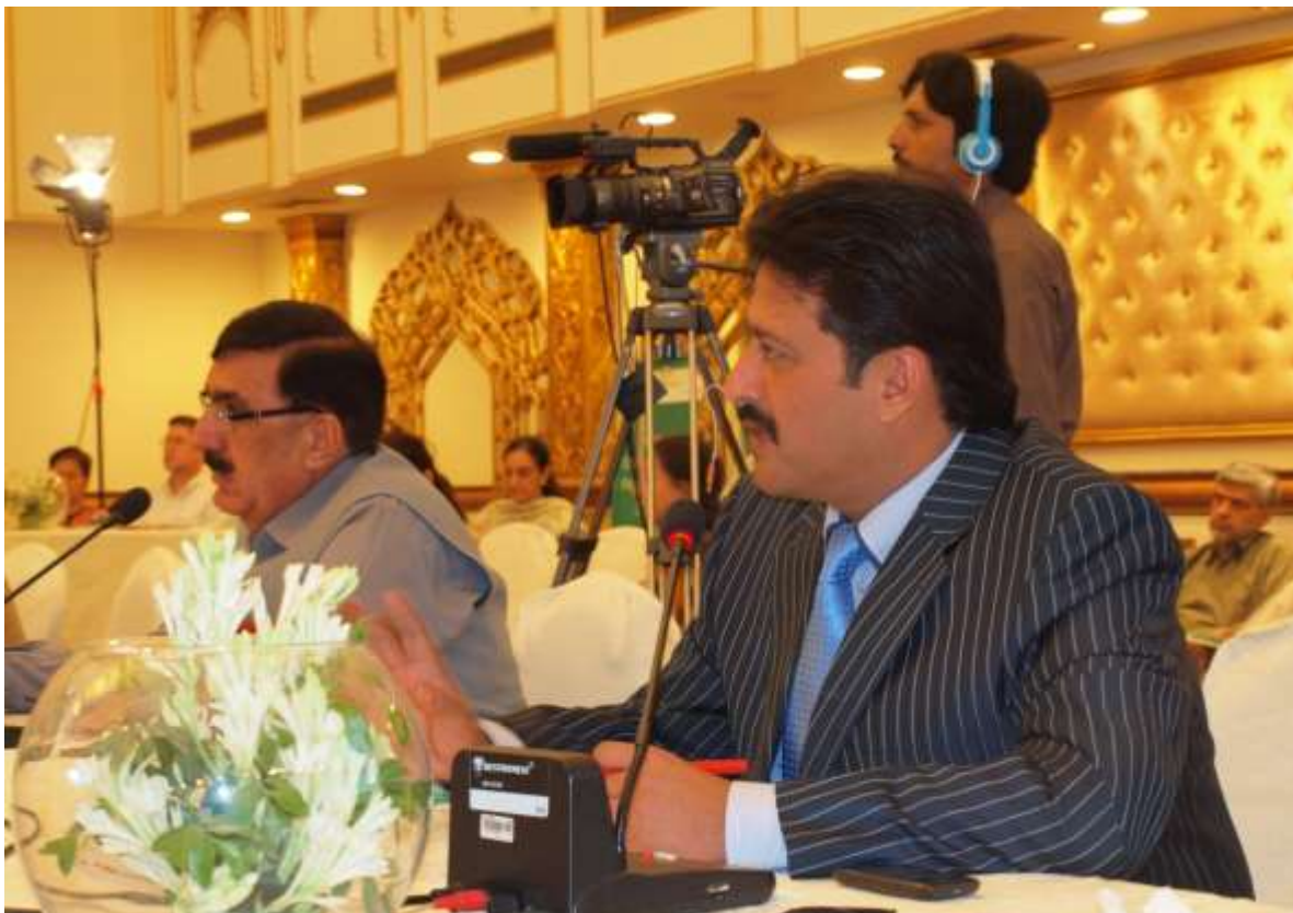
A Public Representative Sharing his thought during the Open Forum Discussion