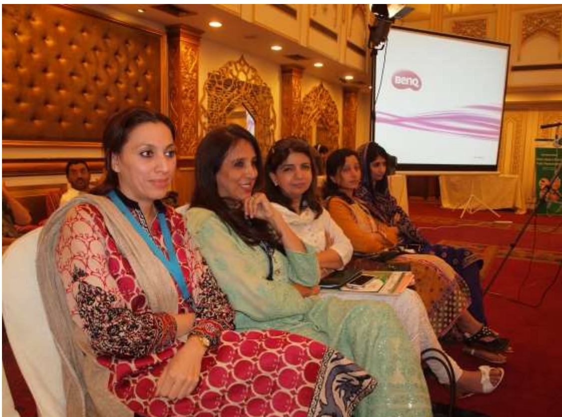
EPI Partners (UNICEF, WHO, GAVI, SACH Reps) at the Event