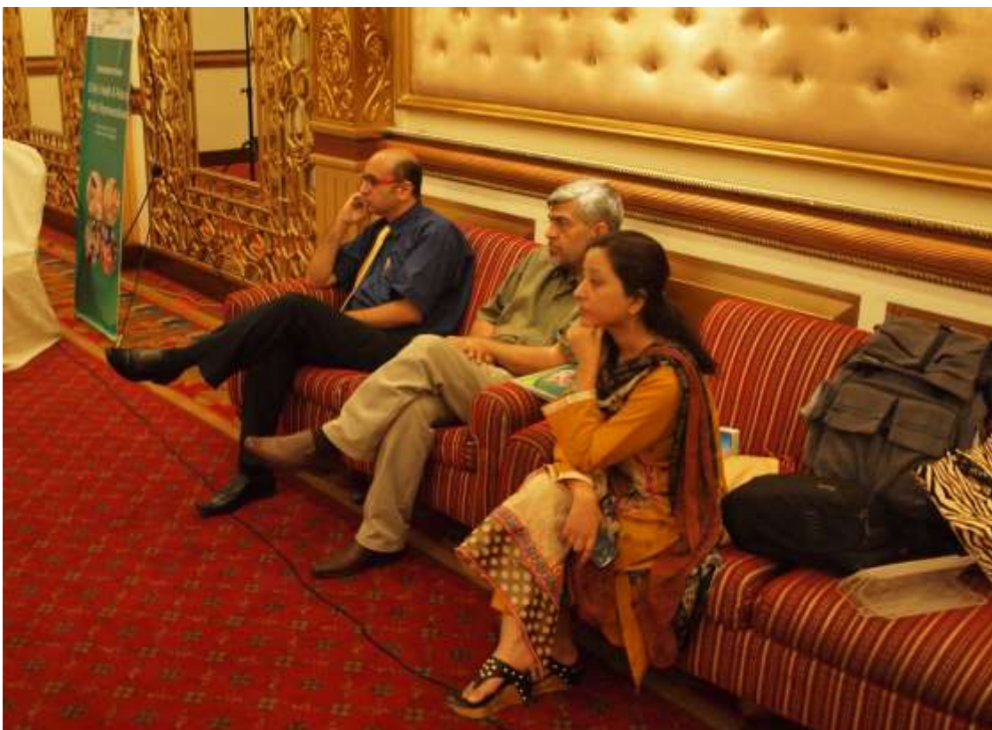
Director Surveillance and Communication Consultant EPI Observing the Proceedings