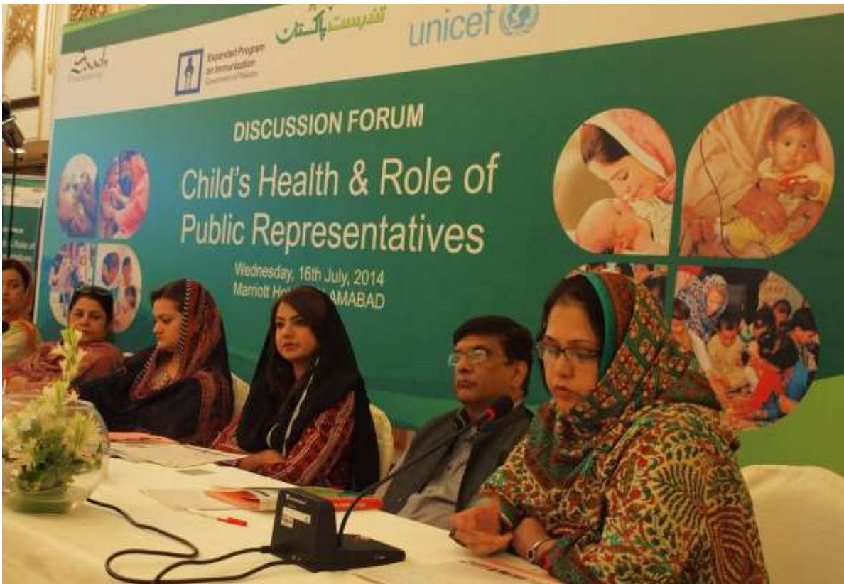
A Public Representative Sharing his thought during the Open Forum Discussion