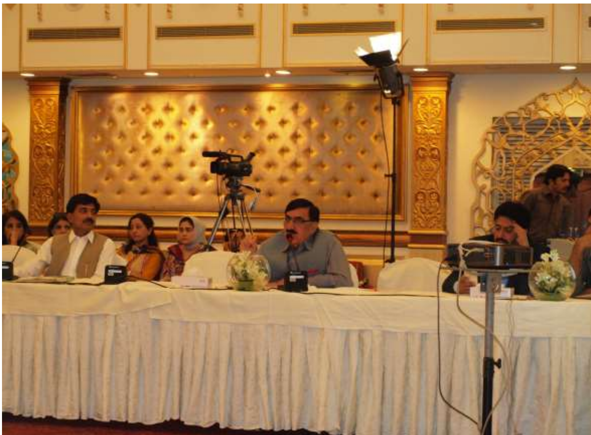
A Public Representative Sharing his thought during the Open Forum Discussion