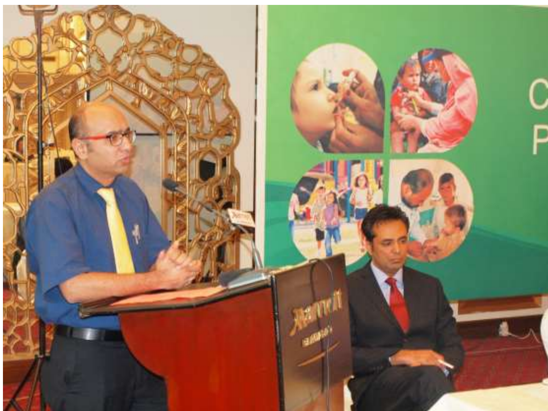
Director Surveillance Delivering his Presentation