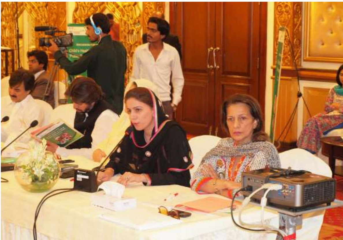
A Public Representative Sharing his thought during the Open Forum Discussion