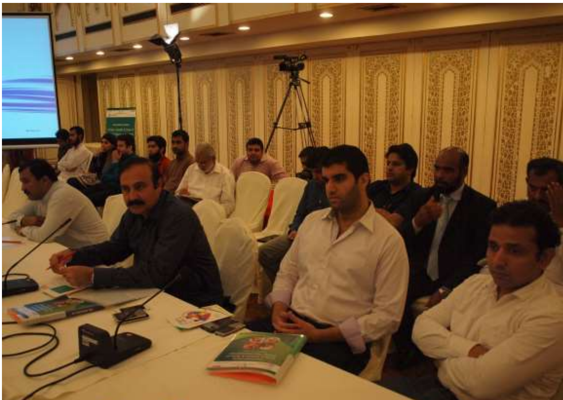
A Public Representative Sharing his thought during the Open Forum Discussion