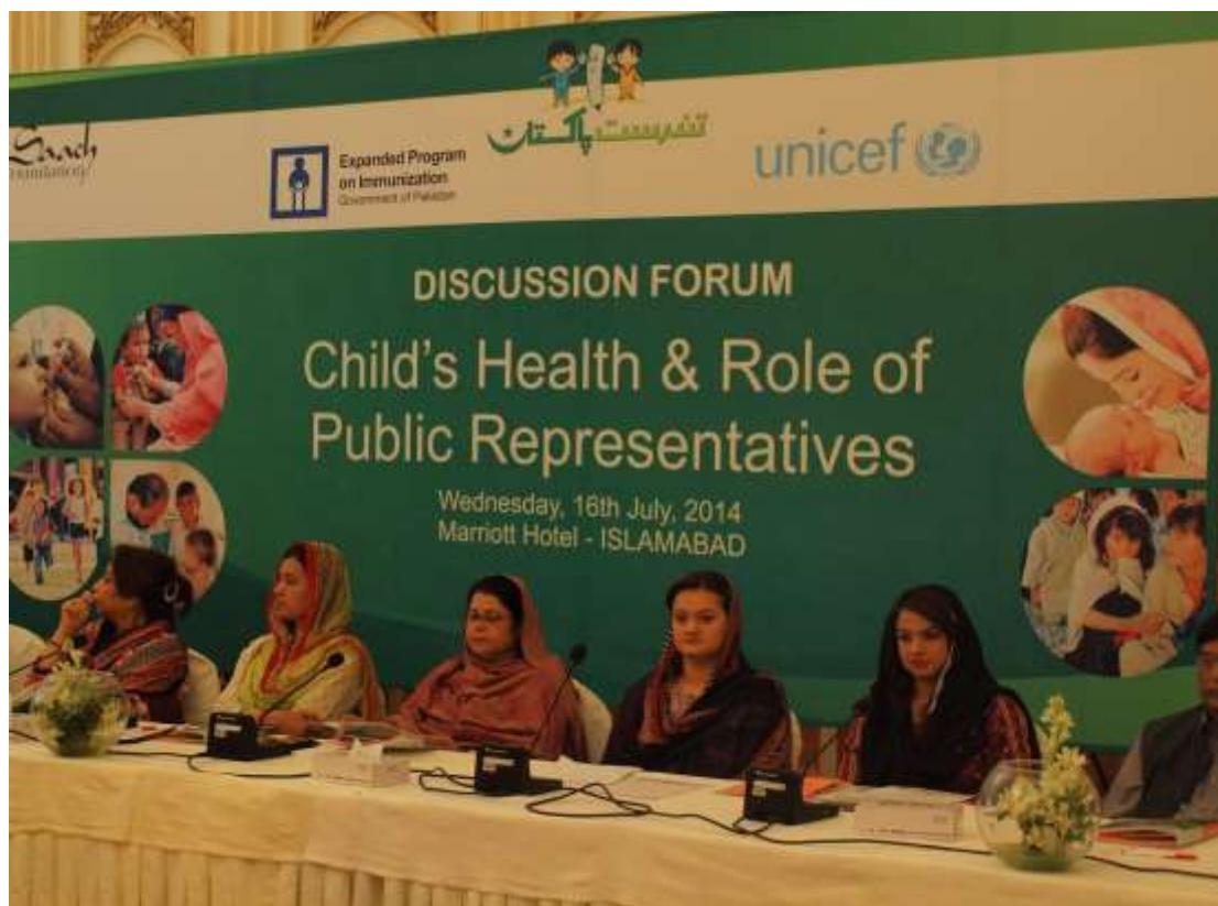
Chief Guest of the Event