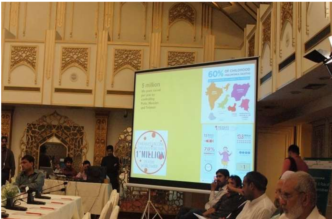
Use of Infographics by Director Surveillance to Inform and Persuade Parliamentarians