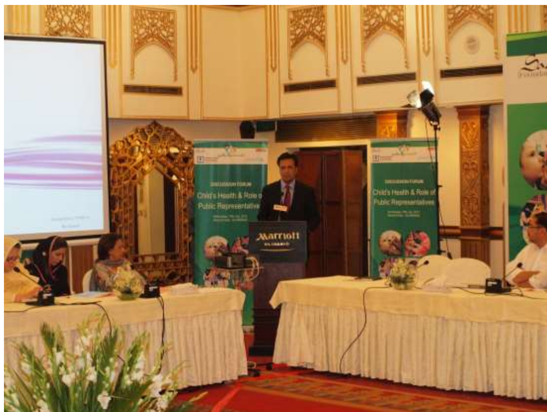
Facilitator conducting the session