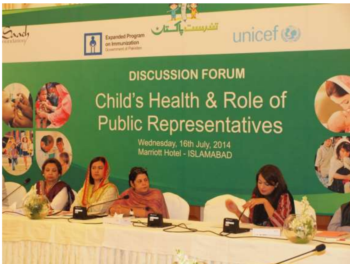
A Public Representative Sharing his thought during the Open Forum Discussion