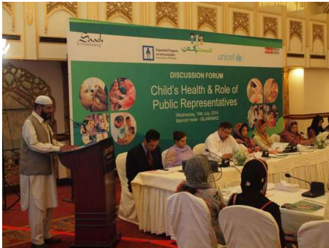
Discussion Forum being started in the name of Allah