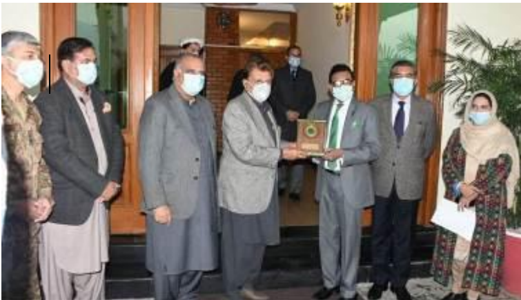
Honourable PM, AJ&K presenting Shield to the WR, WHO