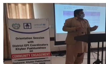
Community Engagement Session in Progress