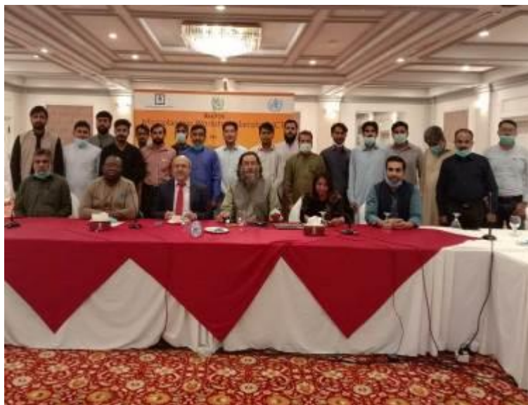
ICT Group Photo at the end of the Session.