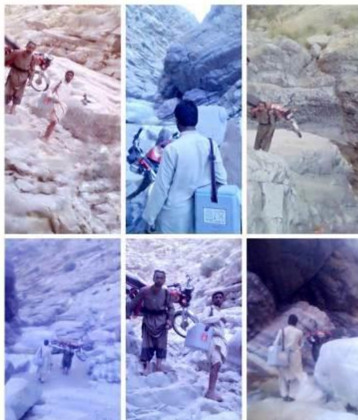
Teams Maneuvering in District Khuzdar for Polio Vaccination and Routine Immunization

These efforts are further supported by the UNICEF provided technical staff at divisional and district level during planning, monitoring and implementation phases. This intervention will certainly have high impact