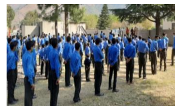
COVID-19 Social Mobilization and Awareness Creation using ICE Materials in Education Institutes