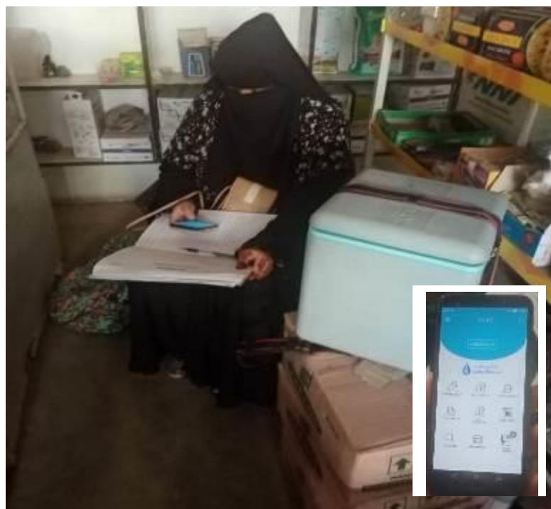
Child Immunization Digital Data Entry in Progress

Digital child registry through "Zindagi Mehfooz" mobile application continued to remain under practice by 34 vaccinators of Directorate of Health Services at EOA as well as at MCI fixed centers. All the vaccinations of children are now registering on daily basis. Further the attendance of the vaccinators is also being assessed on daily basis".