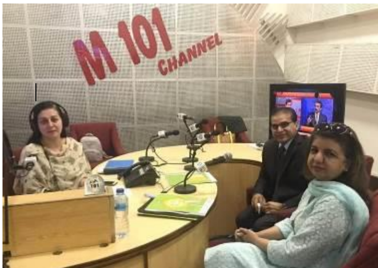
Technical Focal Person and CHIP CSO Coordinator as EPI Reps on World Pneumonia Day Radio Show

https://nation.com.pk/12-Nov-2020/world-pneumonia-day