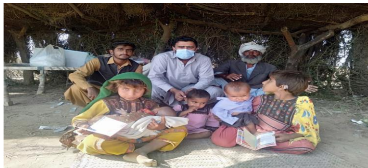
Vaccination in Progress during Enhanced Outreach Activity

Provincial EPI is in process of conducting Data Quality Assessment (DQA) exercise. The aim of DQA is to assess data accuracy, timeliness & completeness, weekly VPD reports, field validation, reporting, recording and monitoring system of EPI and identify weak areas at UC, District and provincial level. A workshop on Data Quality Assessment was organized at provincial level to train the assessment teams to benefit and recognize key areas of reporting system which needs to be focused at various levels and evaluate implementation of previous Data Quality Improvement Plan.