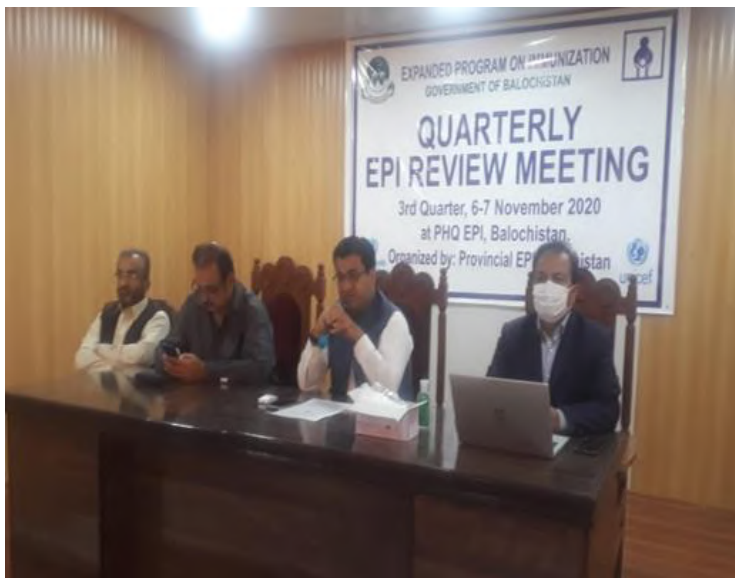
Top Health EPI Officials Balochistan during Quarterly EPI Review Meeting