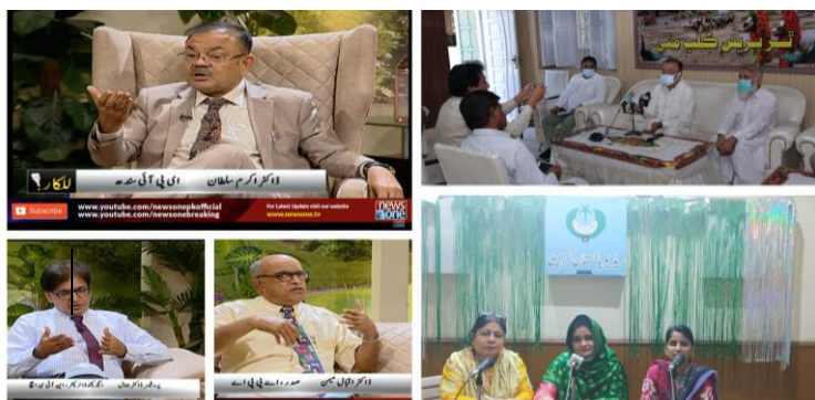
EPI Sindh Presence on all Spectrum of Media