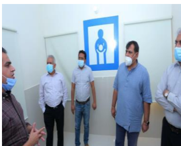
Visit of Refurbished Health Facilities

The Expanded Program on Immunization (EPI) Sindh working strategically tend to partner with the private sector in order to increase the coverage with no child left behind. In this regard, first in the line is signing an MoU with a private healthcare entity named Zubaida Machiyara Trust (ZMT) having free of cost providing 35 health facilities in Karachi; mostly in the slum areas.