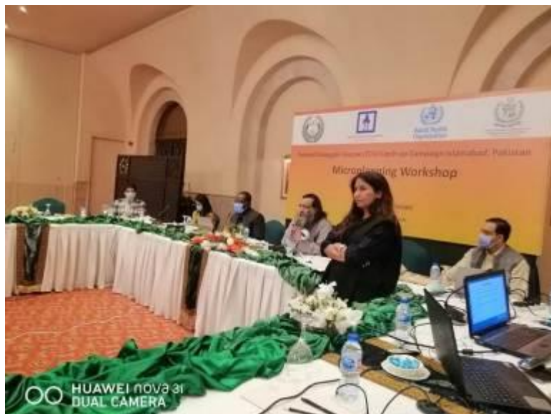
WHO Facilitator Conducting the Training Session

The training focused on the microplanning tools for TCV catch-up campaign, Participants were briefed in detail for emerging trends of multidrug and extreme drug resistant and importance of TCV vaccine for preventive measure. Each tool of microplanning was explained in detail with group work on it. Considering the COVID-19 situation participants were also oriented to address the current challenges of COVID-19. Participants were divided in groups and each group was assigned to mention the effective of TCV, school targets, importance of schools in campaign, challenges due to COVID-19 and solution of these challenges. Each group worked on the challenges and came up with significant solution to address them. Total 78 participants from ICT and CDA were trained in microplanning workshops. On 12th November a batch of 42 participants from CDA whereas a batch of 36 participants of ICT on 13 th November respectively.