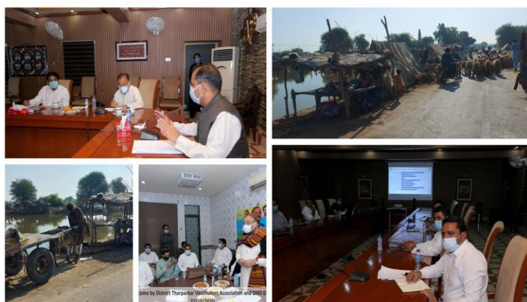
District Field Assessment Visit

EPI provincial office has been continuously focusing on the field assessment and reviews of districts to monitor progress of all EPI indicators. Assigned team were guided to visit the few low and best performing UCs. UNICEF team supported in field assessment, data management, meetings and feedback. Special focus was given on Advocacy, Communications & Social Mobilization (ACSM) activities conducted by the districts. Training refreshers on Inter Personal Communication (IPC) was suggested by field mission. All feedback extracted from the field was properly recorded, documented and communicated to District Health Management Team and district administration.