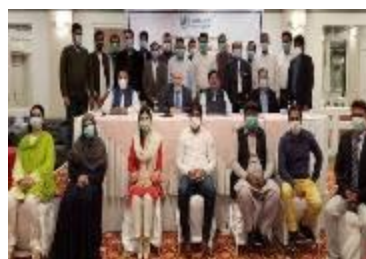
District Monitors Training Group Photo

A Training workshops for district monitors was conducted on 13-14 November 2020 in Islamabad followed by one in Lahore on 16-17 November 2020 on orientation and planning of TCV campaign. These 36 District Monitors were hired for TCV campaign by CTC and supported by WHO. All aspects of routine immunization and TCV campaign were briefly discussed including micro planning, readiness assessment tool and other aspects for a successful implementation of future TCV catch-up campaign.