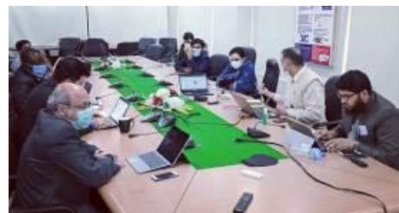
First meeting of COVID-19 NTWG Sub Committee

The pandemic of COVID-19 has tested the capacity of our health delivery system. As the world is responding to COVID-19, Pakistan also advances its efforts to combat the pandemic by harnessing expertise of all stakeholders. In this spirit a national COVID-19 Technical Working Group (NTWG) Sub Committee has been constituted at Federal EPI. This initiative will strengthen Pakistan's response to COVID-19 by assisting NCOC in outlining a clear road map in terms of policy and implementation.