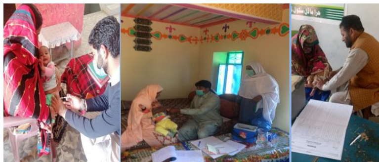
Enhanced Outreach Activity (EOA) Phase-2 All Across AJ&K

EPI AJ&K closely and proactively monitored the scenario and to make up for the situation came up with an innovative approach of implementation of "Enhanced Outreach Activity (EOA) Phase-2 from 9th to 21st Nov, 2020. The EOA Phase-2 targeted the 9 Districts of AJ&K except district Neelum due to managerial constraints with very encouraging results.