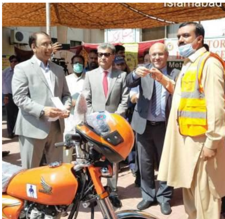
Motorbike is being handed over to the Front Line Worker

In order to ensure the immunization coverage of due and defaulter children and coverage of backlog target children during pandemic, house to house social mobilization was carried out by the daily paid community mobilizers. The efficiency of this initiative and other outreach activities are highly enhanced by the logistic support in form of provision of motor bikes to vaccinators by Federal EPI. The 2-wheelers reaches areas where routine vehicles access was limited and ensure mobility for outreach vaccination, therefore this intervention has proved to be a very effective one.