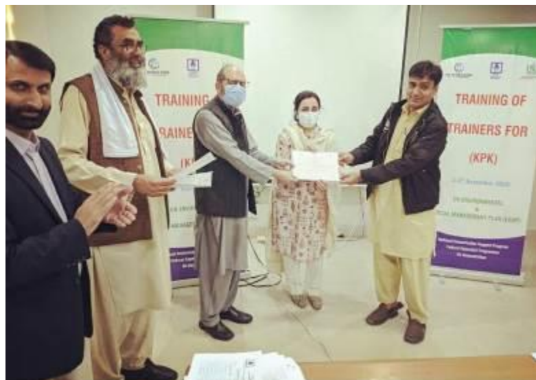
EPI Manager KP, DD Training and National ESMP Coordinator presenting certificates to the participants

ESMP-GRM TOT conducted in four batches for all districts of KP including NMDs in Federal EPI Islamabad. A large number of EPI KP HR were equipped with latest information and best practices on public health and social impacts of the project activities, proposes appropriate mitigation and precautionary measures – most of which are already practiced by the EPI teams. To address these negative impacts, describes institutional and monitoring mechanisms to ensure effective implementation of the proposed mitigation and precautionary measures, and defines the associated documentation and reporting requirements.