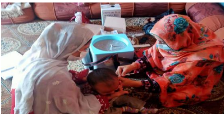
Vaccination in Progress during Enhanced Outreach Activity

Provincial EPI with support of WHO had been conducting Enhanced Outreach Activities (EOA) since December 2018 providing massive support in increasing routine immunization coverage of the province by providing additional resources to increase skill immunization staff for covering to reach every community.