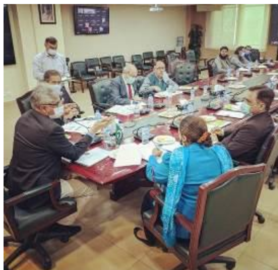
Special Assistant to PM sharing his vision during the NICC meeting