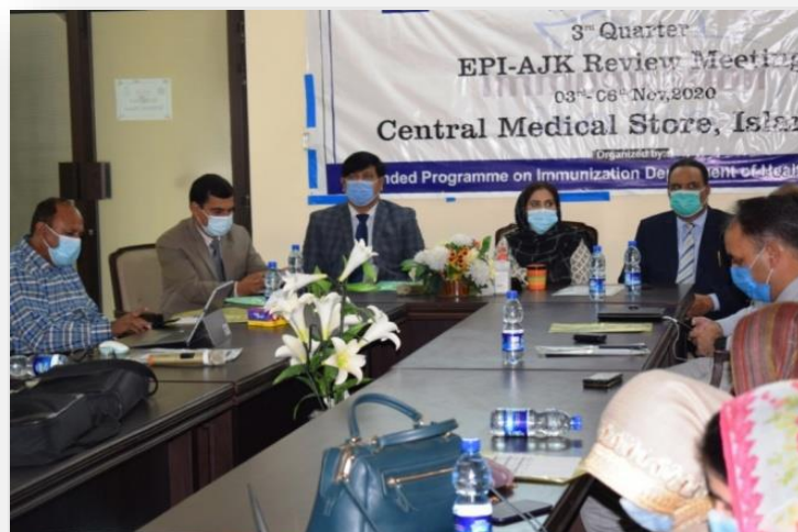
EPI AJK Review Meeting in Progress

The two days comprehensive review was an extensive brainstorming exercise that were Program Managers of vertical programs, DHOs and District EPI Officers actively participated and shared their quarterly progress and highlighted the key achievements and challenges in their respective districts. Different aspects of better coordination, record keeping and reporting, capacity of vaccination staff and prioritization of action areas were discussed at length and it was agreed that EPI at the District level needs to more effectively engage in paving way forward for better and efficient service delivery across AJ&K.