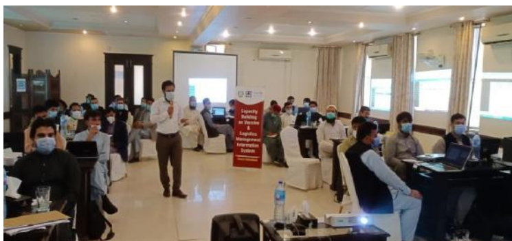
VLMIS Training Session in Progress

Moreover, District EPI storekeepers were also trained on Vaccine and cold chain Equipment Inventory Management continuing working in par with International Organization for Standardization (ISO) 9001 certification standards.