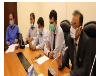
MOU Signing Ceremony Meeting