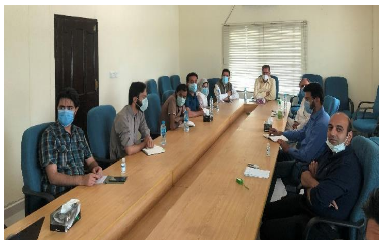
Minister Health Dr. Imam Yar Baig being briefed on EPI, GB Updates

The Minister ensured full support to the EPI-GB Program in future.