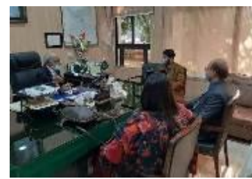
DHS EPI Punjab visits CEO DHA, Rawalpindi