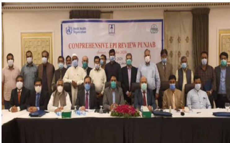
Group Photo at the End of the Comprehensive EPI Review Punjab