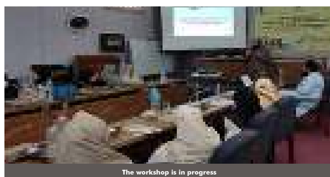
The workshop is in progress

The District Health Officer Quetta in collaboration with EPI Balochistan initiated 24/7 birth dose vaccination within the labor room of government and private tertiary health care hospitals. To better orient vaccinators related to 24/7 birth dose initiative a detailed session was organised in Quetta by the provincial EPI. The session was facilitated by the DHMT. During the session the vaccinators were briefed on protocols of EPI, vaccination techniques, safe injection practice, AEFI, waste management, improving interpersonal skills with parents and caregivers.