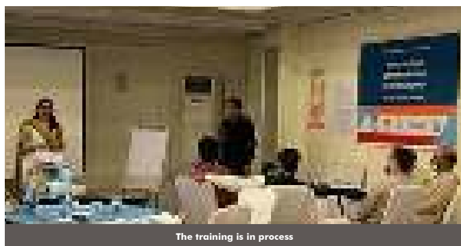
The training is in process