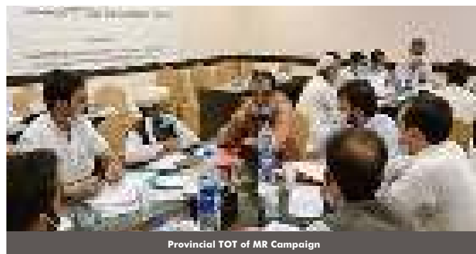
Provincial TOT of MR Campaign

Pakistan is planning for the nationwide measles rubella catch-up campaign in November 2021. The campaign eventually introduces Measles Rubella vaccine in the country's routine immunization program. In this regard, the provincial EPI office has constituted different committees that includes steering, technical, AEFI and communication committees. The initial meetings of the committees were conducted to discuss the preparation of the largest campaign. In KP, the campaign target is to vaccinate more than 14 million children.