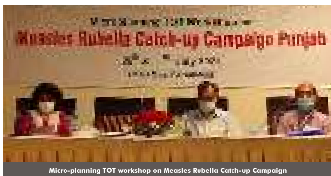
Micro-planning TOT workshop on Measles Rubella Catch-up Campaign