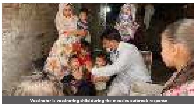
Vaccinator is vaccinating child during the measles outbreak response

The Measles Outbreak response campaign was held in different provinces that included Balochistan, Sindh, Islamabad, KP, GB and Punjab on July 5 to 10. In Sindh, the measles outbreak response campaign was started on July 5 and ended on July 17. The monitors from the Federal EPI monitored the campaign site in different provinces. The monitors were trained on the monitoring tools and they monitored fixed and outreach sites and submitted their findings to district, provincial and federal offices.