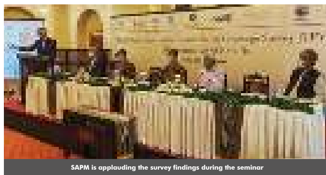
SAPM is applauding the survey findings during the seminar