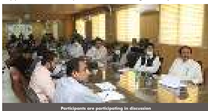
Participants are participating in discussion

The training was attended by the 30 participants that included DHOs, civil society representatives and the EPI team members who enhanced their knowledge and skills with regards to coverage survey with an aim to achieve more than 90% coverage across Balochistan in the years to come. The National Programme Manager of Federal EPI and the Provincial Manager of EPI graced the occasion and expressed their views related to the significance of training. They mentioned that such training help to strengthen health system in the long run and reduce dependency on the support of technical partners for coverage surveys.