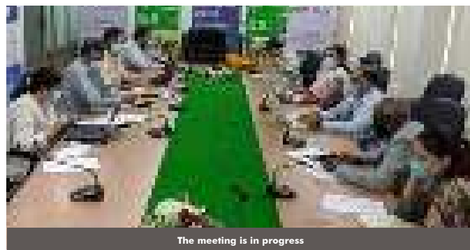
The meeting is in progress

Framework Consultative workshop was to cascade the Federal Level EPI/ PEI synergy best practices reflections at Provincial, District and UC Levels.