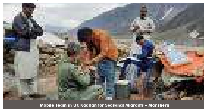
Mobile Team in UC Kaghan for Seasonal Migrants - Manshera

In KP the vaccinators were facing many problems in reaching out to hard areas. In this regard provincial EPI seek support to JICA for mobile vaccination to better immunize the children in hard to reach areas. The JICA supported the provincial EPI and vaccinated 1,000 plus children through that activity.