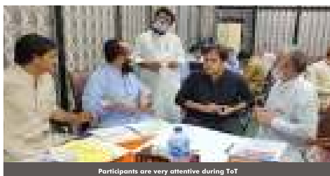
Participants are very attentive during ToT