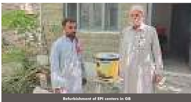
Refurbishment of EPI centers in GB

The refurbishment process of EPI centers in GB is under way. A total of 57 EPI centers were refurbished in District Gilgit, Diamer & Skardu.