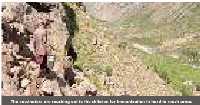
The vaccinators are reaching out to the children for immunization in hard to reach areas

During the month of July, 2021, The EPI Gilgit-Baltistan keeping its pace, vaccinated eligible children and CBAs and reach out to the population through outreach vaccination sessions. The Enhanced Outreach Activities (EOA) were continued throughout GB. During EOAs, EPI frontline health workers reached out to every single child by encompassing their designated catchment areas to provide vaccination services.