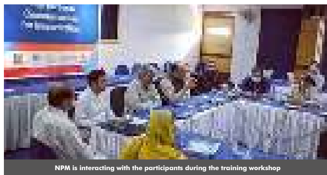
NPM is interacting with the participants during the training workshop

The National training of trainers was held on the newly developed EPI module from 7th to 17th July. The training was organized at Health Service Academy with the support of Federal EPI and UNICEF. The vaccinators from the AJK, GB, Punjab, ICT and CDA participated in the training and equipped with latest tools and resources. The last three days of the training were dedicated to Inter-Personal Communications where they learnt different techniques to better communicate with parents and caregivers. During the training a complete toolkit was also provided to the participants for future learning.