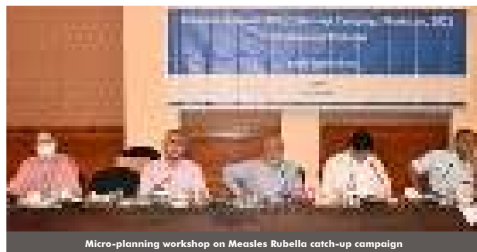
Micro-planning workshop on Measles Rubella catch-up campaign

Nationwide Measles-Rubella catchup campaign is planned to conduct in AJK in November. Since, Measles is one of the leading causes of death among young children globally, despite the availability of safe and effective vaccine, followed by rubella vaccine to be added in the routine immunization. Training of master trainers is a key to develop quality micro plans required for a successful campaign. The training was organized to enhance the capacity of the master trainers. The master trainers further facilitate cascade micro-planning trainings at the district and tehsil levels. The training workshop covered the following areas human resource, logistics forecast, vaccine cold chain assessment & requirements, AEFI Case Reporting and Management and Advocacy, Communication and Social Mobilization (ACSM). The training was chaired by Worthy PPM EPI AJK Dr. Bushra Shams. Participants from all the districts were present and participated efficiently in the training.