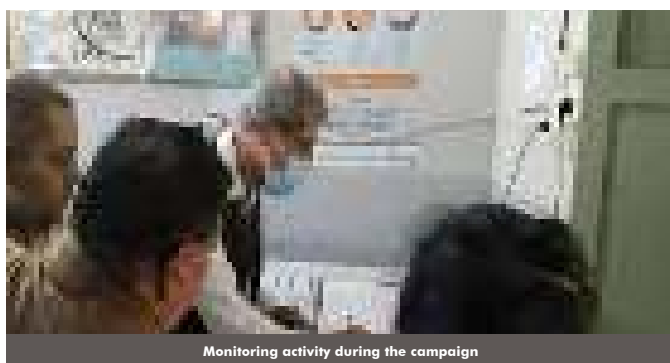
Monitoring activity during the campaign

To make a successful campaign and achieve desired results, a social mobilization and community engagement campaign was launched where community engagement activities were made. Key messages and announcements were made through local mosque to inform community about vaccination campaign started in their areas. 1,174 team were trained to vaccinate the estimated target women and 2,348 supporting staff were also trained to support vaccination process.