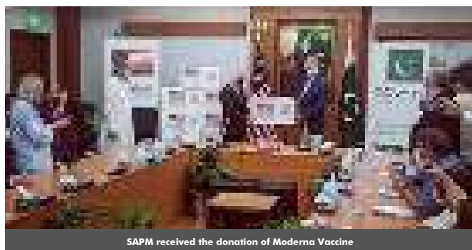
SAPM received the donation of Moderna Vaccine