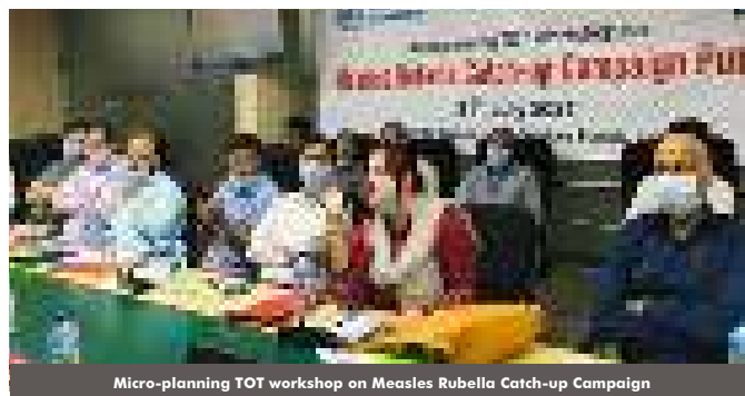
Micro-planning TOT workshop on Measles Rubella Catch-up Campaign

focus on microplanning with a bottom up approach enables to improved MR campaign operational planning.