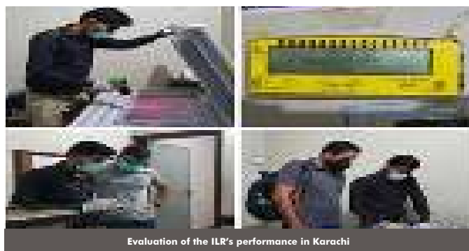
Evaluation of the ILR's performance in Karachi